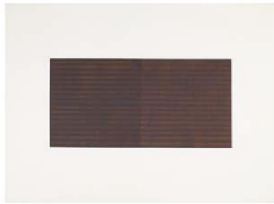
SS1: Sean Scully, Change #5, 1975. Acrylic and tape on paper, 23 1/3 x 30 1/3 inches. Courtesy Neo Neo Inc, New York.