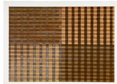
SS15: Sean Scully, Untitled , 1975. Acrylic and tape on paper, 22 11/16 x 30 11/16 inches.