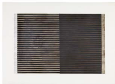
SS11: Sean Scully, Horizontals #5 , 1975. Acrylic, tape, ink and graphite on paper, 22 x 29 15/16 inches.