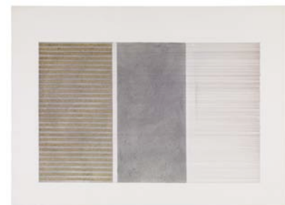
SS8: Sean Scully, Horizontals #1 , 1975. Acrylic, tape, ink and graphite on paper, 21 3/4 x 29 3/4 inches.