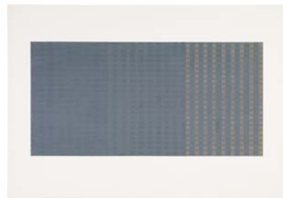
SS4: Sean Scully, Change #22 , 1975. Acrylic and tape on paper, 21 1/2 x 30 1/2 inches.