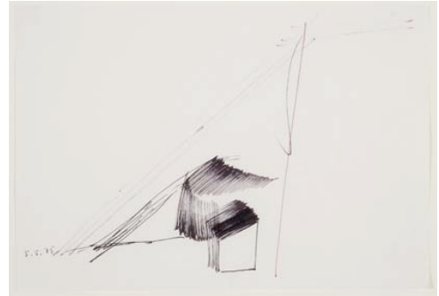
GR4: Gerhard Richter, 5.5.1975 , 1975. Ink on paper, 5 13/16 x 8 inches. Permanent loan from a German private collection, Courtesy Kunsthalle Emden.