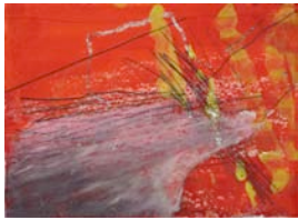
Gerhard Richter, R.O., 2.I.1984 , 1984. Watercolor on paper, 5 1/8 x 7 1/8 inches. Private Collection, Berlin.