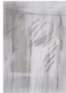
GR19: Gerhard Richter, 30.5.1999 , 1999. Graphite on paper, 11 7/8 x 8 5/16 inches. Permanent loan from a German private collection, Courtesy Kunsthalle Emden.