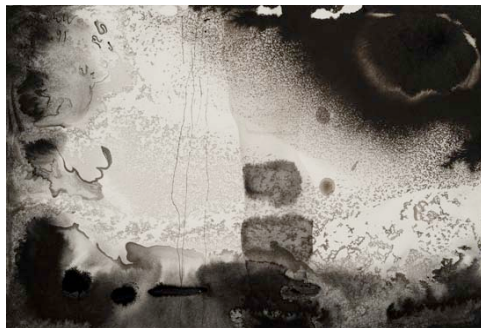
GR14: Gerhard Richter, 7.1991 , 1991. Ink on paper 6 1/2 x 9 7/16 inches. Permanent loan from a German private collection, Courtesy Kunsthalle Emden.