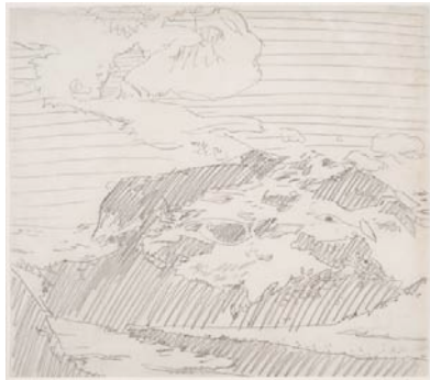
GR1: Gerhard Richter, Gebirge/Mountains , 1968. Graphite on paper, 19 1/4 x 21 1/2 inches. Permanent loan from a German private collection, Courtesy Kunsthalle Emden.