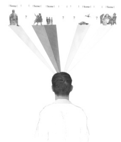
Alexandre Singh, Assembly Instructions (The Pledge- Danny Rubin) , 2012. Framed inkjet ultrachrome archival print, 40 x 50 inches. No. 26 from a set of 32.