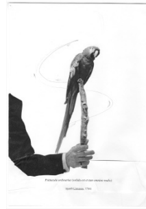
Alexandre Singh, Assembly Instructions (The Pledge- Marc-Olivier Wahler) , 2011. Framed inkjet ultrachrome archival print, 21 x 30 inches. No. 21 from a set of 43.