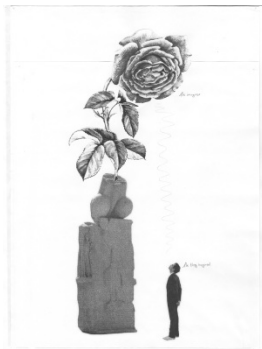
Alexandre Singh, Assembly Instructions (The Pledge- Simon Fujiwara) , 2011. Framed inkjet ultrachrome archival print, 40 x 23 inches. No. 4 from a set of 40.