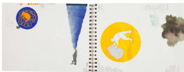
JL31: José Antonio Suárez Londoño, Blaise Cendrars Complete Poems/Poésies Complètes , 2010. Mixed media, 8 x 6 inches (closed), 16 x 6 inches (open), image no. 97, Book 2 of 4.