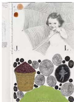
JL22: José Antonio Suárez Londoño, Jacki Lyden, The Daughter of the Queen of Sheba , 2004. Mixed media, 8 3/4 x 5 inches (closed), 8 3/4 x 10 inches (open), image no. 1, Book 1 of 2.