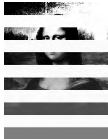
MATT SHERIDAN SMITH, Untitled (contrast test) , 2008. Black and white inkjet print, 8 1/2 x 11 inches. Courtesy of the artist and Lisa Cooley Fine Art.

New York, February 16, 2009 – The Drawing Center is pleased to announce FAX , an exhibition that invites a multi-generational group of artists, as well as architects, designers, scientists and filmmakers, to conceive of the fax machine as a thinking and drawing tool. Participants will transmit fax-based work—some seminal examples of early telecommunications art—via the museum’s working fax line throughout the duration of the exhibition, on view in the Drawing Room from April 17 through July 23, 2009. The active accumulation of information—received in real time, in the exhibition space—will include drawings and texts, and the inevitable junk faxes and errors of transmission, creating an ongoing cumulative project concerned with reproduction, obsolescence, distribution, mediation, and generative systems. The exhibition is curated by João Ribas, curator of The Drawing Center, New York, and is accompanied by an illustrated catalogue co-published by iCI and The Drawing Center (available in September 2009). FAX is co-organized by The Drawing Center, New York, and Independent Curators International (iCI), New York, and circulated by iCI.