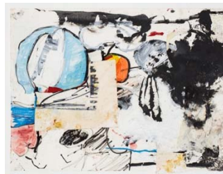
Eddie Martinez, Blue Moon Blackout , 2016. Ink, enamel, crayon, oil paint, oil stick, acrylic paint, collaged paper, and napkin on paper, 22 1/2 x 30 1/4 inches.