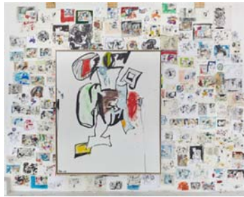
Eddie Martinez, Installation view of the “Drawing Wall” in the artist’s studio, 2017. Painting: Eddie Martinez, Untitled, 2015. Silkscreen ink, oil paint, spray paint, and enamel on canvas, 72 x 60 inches.

*All works are courtesy of the artist, Mitchell-Innes & Nash, New York and Timothy Taylor Gallery, London, unless otherwise noted.