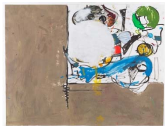
Eddie Martinez, Open Seasonal , 2016. Oil paint, acrylic paint, ink, oil stick, enamel, and gel medium on paper, 38 x 50 inches.