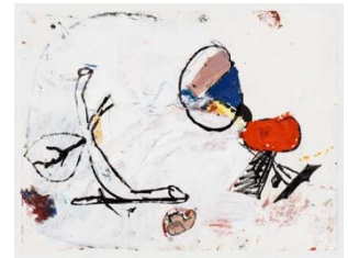
Eddie Martinez, Untitled , 2016. Acrylic paint, marker, crayon, and paper collage on paper, 38 x 50 inches.