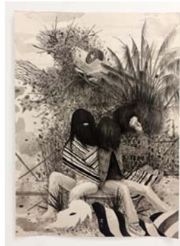
Eric Ramos Guerrero, Lean Like a Camaro , 2016. Graphite and ink on paper. 14 x 20 inches. Courtesy of the artist.