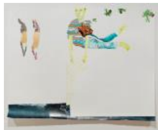
ruby onyinyechi amanze, The Divers , 2016. Graphite, ink, photo transfers, fluorescent acrylic, colored pencils. 38 x 50 inches.

For further information and images, please contact Molly Gross, Communications Director , The Drawing Center 212 219 2166 x119 | mgross@drawingcenter.org