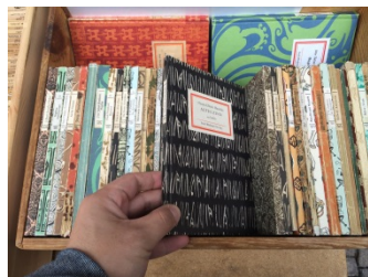
Lei Lei, Books on Books , 2013-16. Video, collage on paper. Dimensions variable.