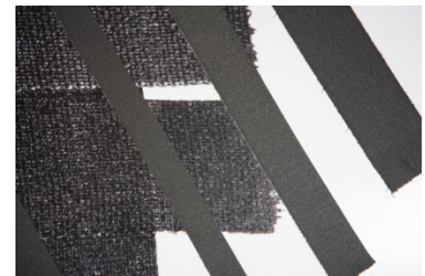
Nsenga Knight, Untitled (Plateau #1) , 2016. Archival inkjet print. 32 X 40 inches.