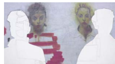
Ezra Wube, When we all met , 2009. Stop action animation, mixed materials on Mylar, 3' 54".