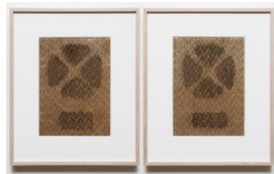
Gabriel de la Mora, B-91 , 2015. Vintage radio speaker fabric, 12 5/8 x 9 1/8 inches each.