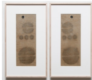
Gabriel de la Mora, B-196 , 2015. Vintage radio speaker fabric, 17 3/8 x 6 3/4 inches each. Courtesy of Timothy Taylor, London; Projectos Monclova, Mexico City; and Sicardi Gallery, Houston.