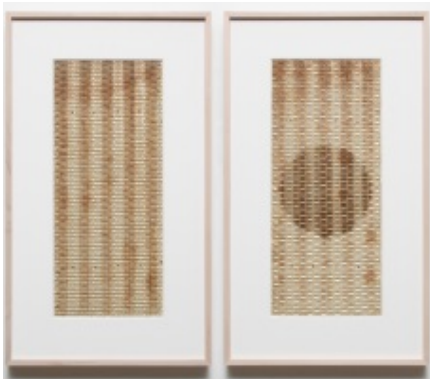
Gabriel de la Mora, B-53 , 2015. Vintage radio speaker fabric, 19 3/4 x 8 1/2 inches each.