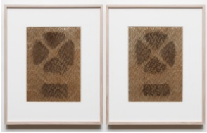
Gabriel de la Mora, B-91 , 2015. Vintage radio speaker fabric, 12 5/8 x 9 1/8 inches each. Courtesy of Timothy Taylor, London; Proyectos Monclova, Mexico City; and Sicardi Gallery, Houston.

New York – The Drawing Center presents Mexican artist Gabriel de la Mora’s exhibition Sound Inscriptions on Fabric , an installation of fifty-five pairs of found speaker screens, each of which carries the “drawn” imprint of dust generated by the sound of countless voices, songs, commercials, news broadcasts, and static that passed through the fabric screen during the speaker’s useful life.