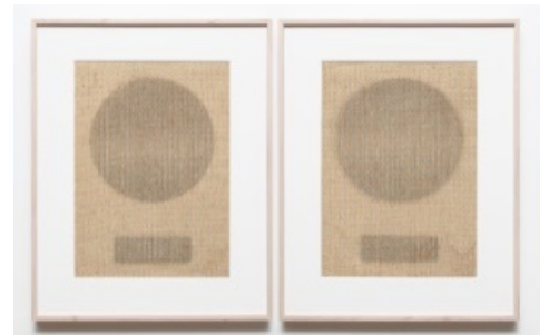
Gabriel de la Mora, B-79 , 2015. Vintage radio speaker fabric, 19 x 13 3/8 inches each.