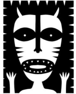
Jad Fair, Tiger Man , 2014. Paper-cutting, 8 x 11 inches. Courtesy of the artist.