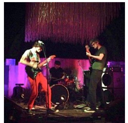
Les Bon Hommes.