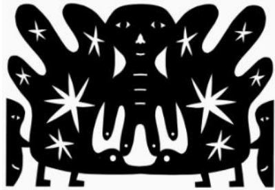
Jad Fair, Bird Man , 2014. Paper-cutting, 8 x 11 inches.