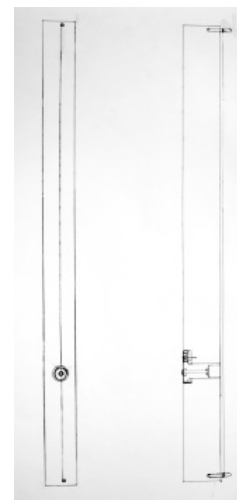
Spencer Topel, Prototype sound form of front and cutaway perspectives created for the site-specific installation Echoic Memory , 2015. Ink on vellum paper, 23 x 35 inches.