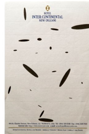
Billy Martin aka Illy B Untitled , 2010-15. Ink on paper. Courtesy of the artist