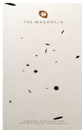
Billy Martin aka Illy B Untitled , 2010-15. Ink on paper. Courtesy of the artist