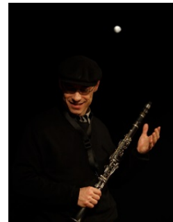
Ned Rothenberg.