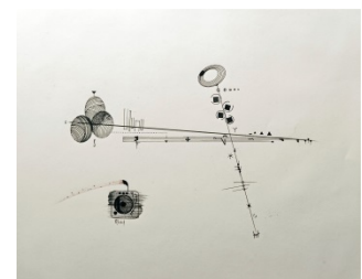
Billy Martin aka Illy B Untitled , 2010-15. Ink on paper.