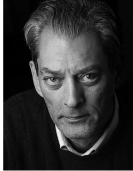
Paul Auster.