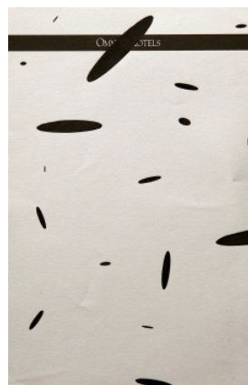
Billy Martin aka Illy B Untitled , 2010-15. Ink on paper. Courtesy of the artist