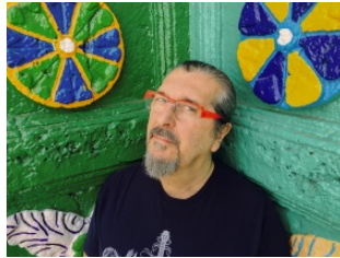
Cyro Baptista.