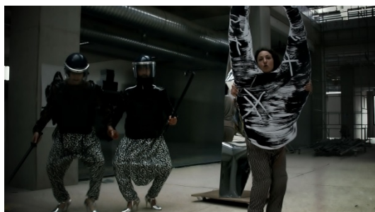
İnci Eviner, Still from Runaway Girls , HD Video loop, surround sound. © İnci Eviner 2015. Courtesy of the artist and Galerie Nev, Istanbul.