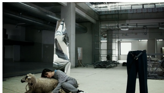
İnci Eviner, Still from Runaway Girls , HD Video loop, surround sound. © İnci Eviner 2015. Courtesy of the artist and Galerie Nev, Istanbul.