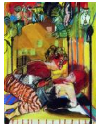
Brier Rose III , 2011–14 Gouache and chalk pastel on Arches paper 22 x 30 inches (55.9 x 76.2 cm) Courtesy of the artist and Rhona Hoffman Gallery (Chicago); ACME (Los Angeles)