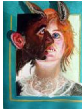
The Lettuce Donkey III , 2011–14 Gouache and chalk pastel on Arches paper 22 x 30 inches (55.9 x 76.2 cm) Courtesy of the artist and Rhona Hoffman Gallery (Chicago); ACME (Los Angeles)