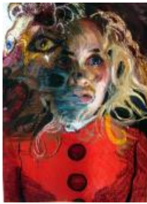
All Fur III , 2011–14 Gouache and chalk pastel on Arches paper 22 x 30 inches (55.9 x 76.2 cm)

For further information and images, please contact Molly Gross, Communications Director , The Drawing Center 212 219 2166 x119 | mgross@drawingcenter.org