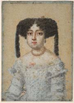
Jacob Ferdinand Voet (b. Antwerp, 1639-1689 – d. Paris, 1700). Portrait de femme vue de face [Portrait of a woman viewed frontally (front view)]. Pastel on blue paper, 225 x 160 mm. Inv. No. PM 1779. Paris, Ecole nationale supérieure des beaux-arts.

New York – The Drawing Center will present Portraits from the École des Beaux-Arts Paris , an exhibition that explores four hundred years of portrait drawings, emphasizing work from live models. Each week, a different set of four portraits from different centuries and with different formal qualities will be hung "in dialogue" with each other in a specially-built room located in the center of The Drawing Center's Main Gallery. Forty portraits have been chosen from the collection of Beaux-Arts de Paris based on diverse criteria such as the male and female gestures, caricature, frontal gaze, social class, and profession of the model. The room is inspired by the intimate gallery at the Galleria Doria Pamphilj in Rome where Velazquez's portrait of Pope Innocent X (c.1649) hangs, which only accommodates a small number of visitors at a time and was designed to provide a space for close viewing and contemplation without crowds. The remaining thirty-six portraits in the exhibition will be hung on the gallery's outside walls and will be visible to the visitor throughout the exhibition's run.