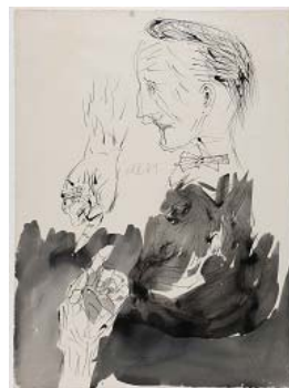
Georg Baselitz (b. Deutschbaselitz, 1938 – ). Sans titre (Marcel Duchamp) [Untitled (Marcel Duchamp)], 2001. Pen, India ink, and wash of India ink, 778 x 575 mm. Inv. no. EBA 5367. Paris, Ecole nationale supérieure des beaux-arts.