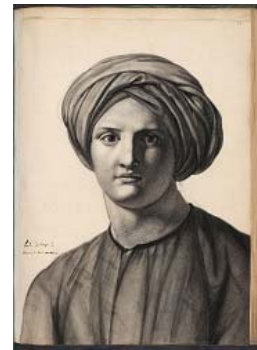
André Dutertre (b. Paris, 1753 – d. Paris, 1842). Portrait de l'aide de camp de Mourad Bey (Portrait of Murad Bey's aide-de-camp). Charcoal, 522 x 374 mm. Inv. No. PC 11155-47a. Paris, Ecole nationale supérieure des beaux-arts.