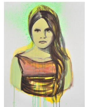
Claire Tabouret (b. Pertuis, 1981 – ). Les Débutantes.1 (The debutantes.1), 2014. Acrylic and vinyl paint on paper, 610 x 460 mm. Private collection.