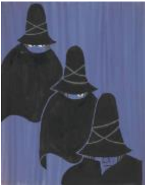
Untitled , 1961 (drawing for The Three Robbers ). Collage of cut paper, gouache, and marker on paper, 11 3/4 x 9 1/4 inches.

New York – The Drawing Center presents Tomi Ungerer: All in One (January 16–March 22, 2015), the first US retrospective of this extraordinary artist. Beginning with his childhood drawings depicting the Nazi invasion of Strasbourg, through his work in New York and Canada, and concluding with the artist's most recent political and satirical campaigns, as well as his illustrations for the 2013 children's book Fog Island , Tomi Ungerer: All in One re-introduces this wildly creative individual to New York City and the world. The exhibition occupies the entire Drawing Center, with a spotlight exhibition of Ungerer's erotic drawings in the Drawing Room and animations in the lower-level Lab gallery. Curated by Claire Gilman, Curator.