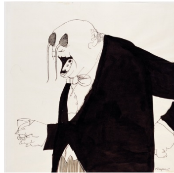
Untitled , 1966 (drawing for The Party , first pub. 1966 by Paragraphic Books, Grossman Publishers, New York) Ink and ink wash on paper 18 x 18 inches (45.8 x 45.8 cm). Collection Musée Tomi Ungerer – Centre international de l'illustration, Strasbourg © Tomi Ungerer/Diogenes Verlag AG, Zürich.