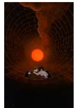
Untitled , 2011 (drawing for Fog Island , first published 2012 as Der Nebelmann by Diogenes Verlag AG, Zürich). Ink, pastel, colored pencil and collage on black paper. 16 5/8 x 10 3/8 inches (42.2 x 27.4 cm) . Tomi Ungerer Collection, on loan to the Tomi Ungerer Museum, Strasbourg © Tomi Ungerer/ Diogenes Verlag AG, Zürich.