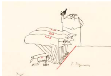
Untitled , 1962 [variation on Der Herzinfarkt (Heart attack), pub. 1962 by Diogenes Verlag AG, Zürich]. Ink and colored pencil on tracing paper. 4 3/8 x 6 1/2 inches (11 x 16.5 cm) Tomi Ungerer Collection, Ireland.