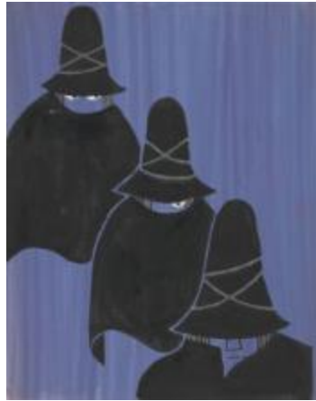
Untitled , 1961 (drawing for The Three Robbers ). Collage of cut paper, gouache, and marker on paper, 11 3/4 x 9 1/4 inches.

For further information and images, please contact Molly Gross, Communications Director , The Drawing Center 212 219 2166 x119 | mgross@drawingcenter.org