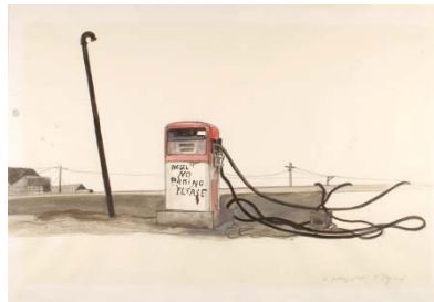
No Parking Please , 1971-1983 (unpublished drawing for Slow Agony , first published 1983 by Diogenes Verlag AG, Zürich). Black grease crayon, black ink and colored ink wash on paper 23 5/8 x 35 inches (60 x 89 cm) Collection Musée Tomi Ungerer – Centre international de l'illustration, Strasbourg © Tomi Ungerer/ Diogenes Verlag AG Zürich.