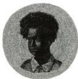
Manfred Kirschner, Kunsttheorieuntersetzer - Lila-Mae , 2014. Drawing / C-print, 11 7/10 x 8 3/10 inches (29.69 x 21 cm).