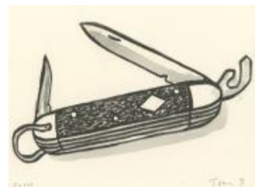
Thomas Slaughter, Boy Scout Jack Knife , 2014, Ink on paper 9 x 12 inches (22.86 x 30.48 cm).