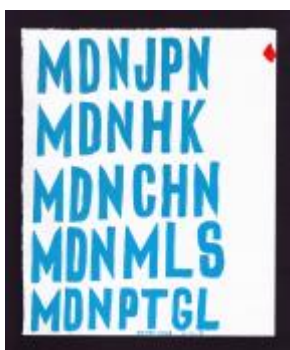
Kenny Cole, MDNJPN , 2014 Gouache on paper 8 1/2 x 7 inches (21.6 x 17.8 cm).

For further information and images, please contact Molly Gross, Communications Director, The Drawing Center 212 219 2166 x119 | mgross@drawingcenter.org