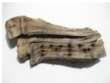
Cui Fei, Leaves , 2014, Mixed media 8 1/2 x 4 1/4 x 1 1/2 inches (21.6 x 10.8 x 3.8 cm).