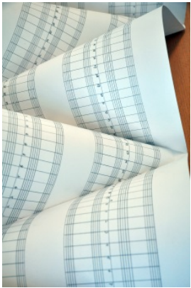
William Engelen, Falten for String Quartet , 2012.

New York – The Drawing Center presents William Engelen: Falten , an exhibition of a new series of musical scores for percussion by the Berlin-based artist. Engelen's Falten [Folds] build musical compositions from folded paper. At the start of each composition, Engelen draws a time line on a sheet of paper. Each centimeter of paper corresponds to one second in the score. The artist shapes the paper into three-dimensional forms—ovals, cones, or even knots. He then hand-draws a staff notation on the sections of the paper that are not hidden in the folds. Through this structure of creases and lines, Engelen organizes, through both intention and chance, the elements of sound and silence in each piece. The landscape of the paper determines the music that can be made from it.