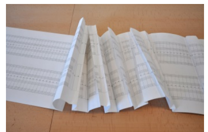
William Engelen, Falten for String Quartet , 2012.