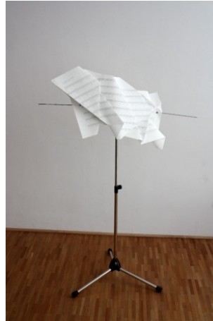
William Engelen, Falten for Percussion , 2013.