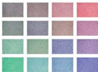
Ignacio Uriarte, BIC Transitions , 2010, BIC pen on paper, Sixteen drawings, each: 11 13/16 x 16 9/16 inches. Courtesy of the artist and Nogueras Blanchard, Barcelona. Photograph by Simon Vogel.