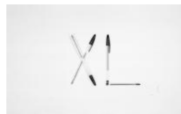
Ignacio Uriarte, XL (detail), 2009, Eighty black-and-white 35mm slides, Continuous loop.