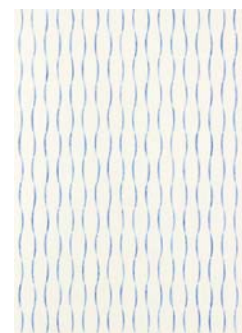
Ignacio Uriarte, Blue Wrist Suite , 2012. Ballpoint ink on paper, One of four drawings, each: 27 9/16 x 19 11/16 inches.